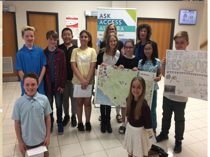
Mrs. Moffitt's students presented their dog park idea to Aurora's Town Council tonight. The students were amazing! This is student voice in action! Way to go!